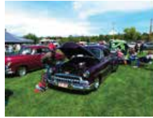
A Field of Beauties

Amazing Family Night (Manchester Recreation Complex) - Manchester Tomahawk Throwing (South Cumberland State Park) – Monteagle Celebration City Region Car Club Cruise-In on the Square (Downtown Square) – Shelbyville