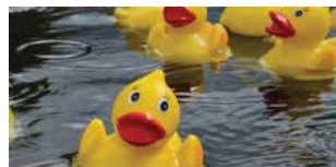
Leader of the Pack

“Ducks on the Duck” (Sponsored by United Way of Bedford County) – Shelbyville