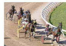
The Race is On!

Lincoln County Fair (Lincoln County Fairgrounds) – Fayetteville