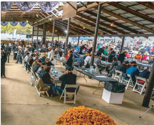
Judging the BBQ