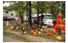
Halloween at the Campground

Adult Halloween Costume Contest (Prichard's Distillery) - Kelso 3rd Annual Halloween in the Campground (Henry Horton State Park) – Chapel Hill WHOA Halloween Show - TWHBEA World Series Regional Double Point Show (Harlinsdale Farm) – Franklin Old Stone Stories: Secrets, Specters, and Scares (Old Stone Fort State Park) – Manchester Backpack the Gizzard (South Cumberland State Park) - Monteagle Fire on the Mountain Chili Cookoff (16 Dixie Lee Avenue) - Monteagle Boo and Brew Festival (On the Square – 4 – 8 p.m.) – Shelbyville Haunted Island 6:00 PM (Tims Ford State Park) – Winchester*