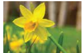
Such a Beauty!

Daffodil Day – Bell Buckle** March Overnight Backpacking Workshop (Henry Horton State Park) – Chapel Hill Spring Hike at the Old Stone Fort (Old State Fort State Park) – Manchester Day Loop Hike (South Cumberland State Park) – Monteagle First Day of Spring Workshop (South Cumberland State Park) – Monteagle Spring Hike and Storybook Trail Grand Opening (Tims Ford State Park) – Winchester