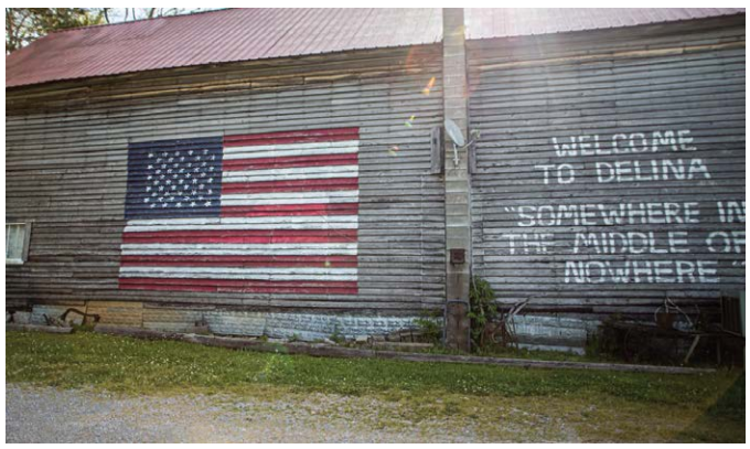
Brown Bag Burger Days