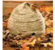
A Real Beehive