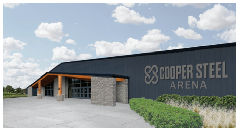
An architectural rendering of Cooper Steel Arena's façade after upgrades.

The Celebration made a big announcement Monday night, January 23rd: the well-known Calsonic Arena will soon be renamed the Cooper Steel Arena.